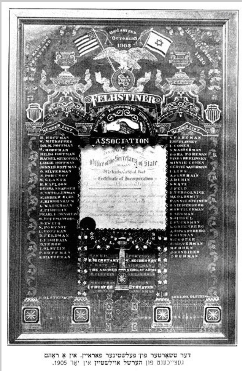
דער טשאַרטער פֿון פעלשטינער פֿאראײן. אין אַ ראָהם נעצײכענט פֿון הערשל אױלשטיין אין יאָר 1905.