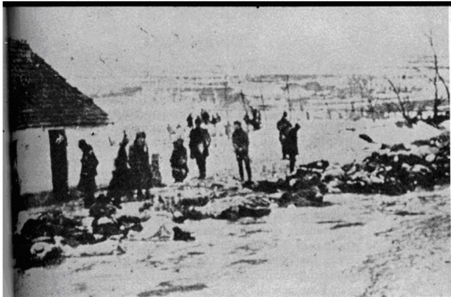
Cadavers in the snow at Felshtin; February 17, 1919.